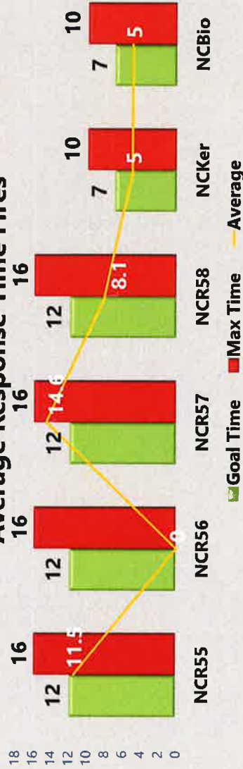
Average Response Time Fires